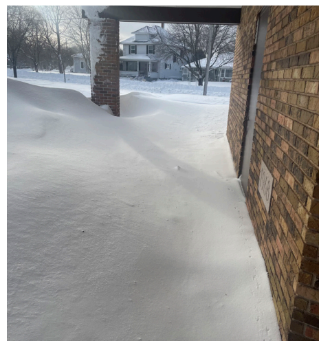
PHOTO: The blizzard of Dec. 28th & 29th leaving our Sexton with much work!