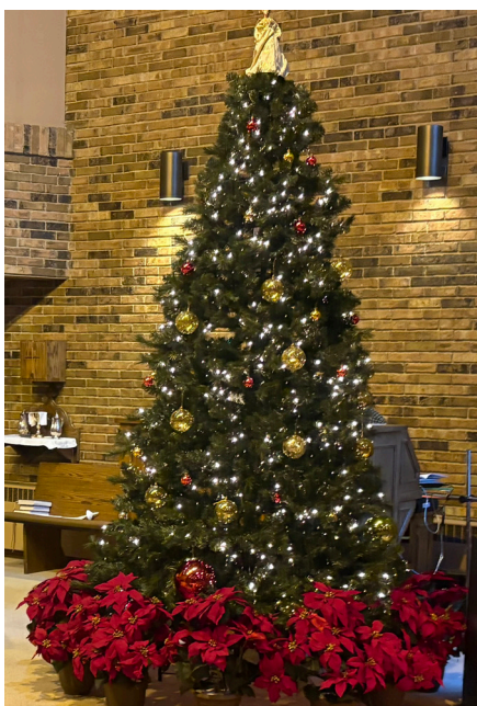
PHOTO: St. Stephen's 2025 Christmas tree

When reflecting on his life's purpose, he is quoted as saying: "The aim and final end of all music should be none other than the glory of God and the refreshment of the soul." ♥